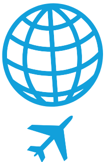
Generous Paid Leave