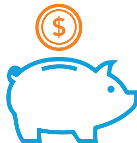
401(k) & ESOP