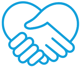
Philanthropic Matching Gift Program